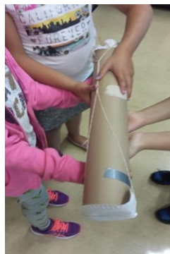
Golf Ball Challenge