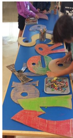
Creating our Makerspace